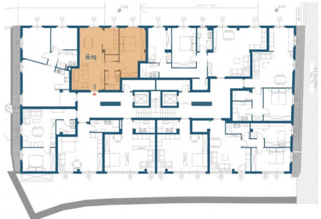
PIANTA PIANO S1